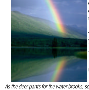
As the deer pants for the water brooks, so pants my soul for You, O God. My soul thirsts for God, for the living God. When shall I come and appear before God? Psalm 42:1 & 2

Are we thirsting after righteousness? Does the Water of Life we are offered freely mean something to you yet?